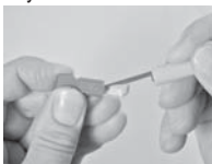
Figure 2 - Full Insertion